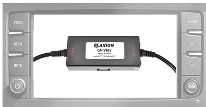
Radio not included in delivery

Camera connection to the IVECO IVECONNECT navigation radio